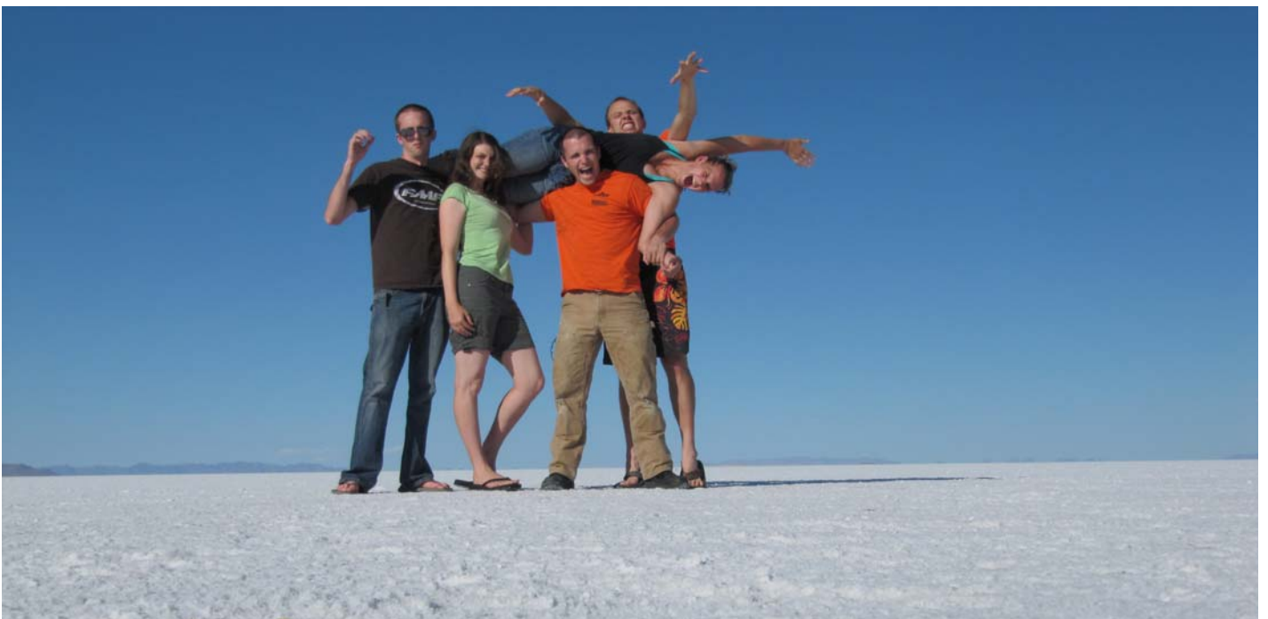
This is me with some friends at the great salt flats two summers ago :D