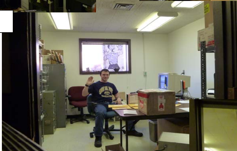
My Office! (Note: Zombie! Ahhhhhhhhhhhhhhhhhhhh! !!!!!!!)