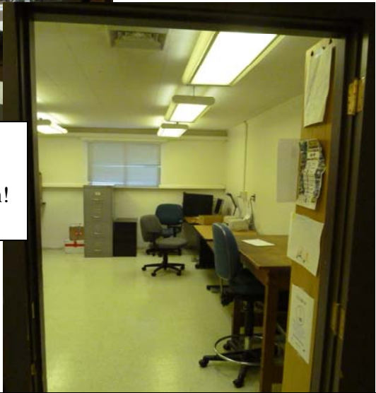
What’s all that Shininess? OMG, that’s a floor! How did the intern end up with all the clean floor space!