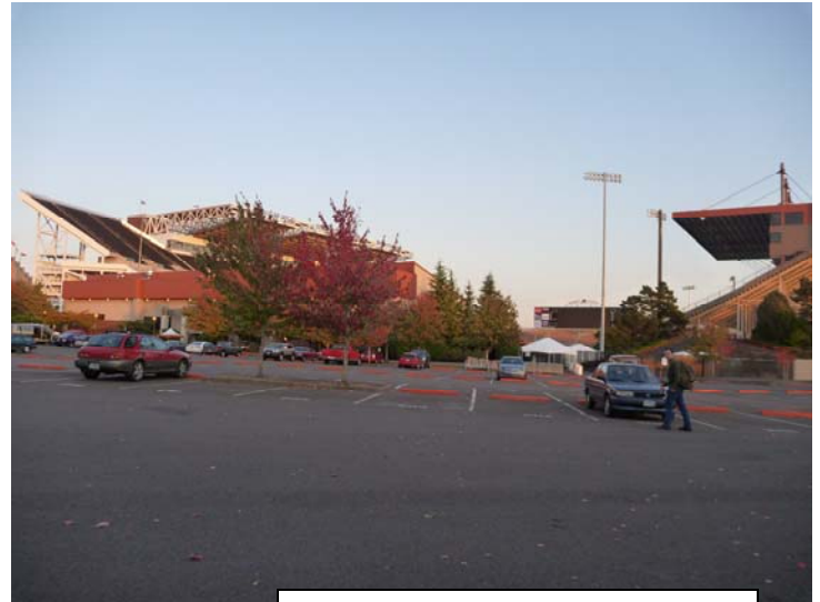
The OSU Football Stadium, 10 th biggest in the PAC10!! Take that!

And to think that we just hired him full time, that sneaky sneaker. Oh well. My walk home is pretty nice. I go past the football stadium and the university quad. I stopped in and said hi to the osu solar vehicle team on the way, they're chugging along on the solar array for the new solar vehicle.