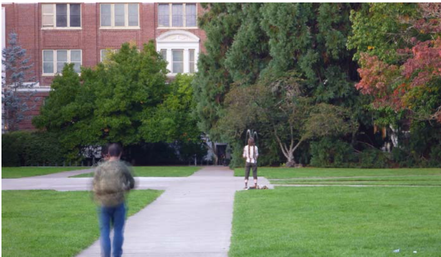
There's always something going on in the Quad, even if it's just that guy in the mismatched argyle socks juggling, and that is not a bald spot, the sun was at a really bad angle....