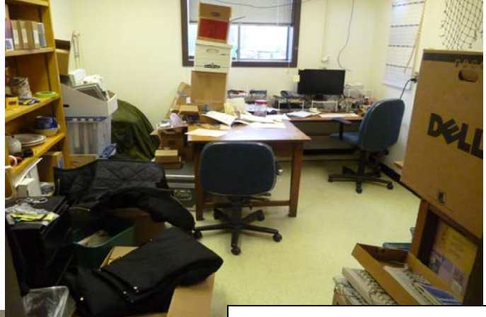
Computer guys office (well ok, he did a lot of that himself, note the teetering tower of boxes on desk..