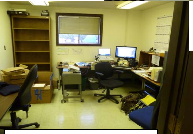
My boss seems to have kept some of the frightening out..