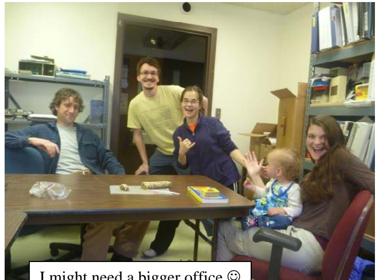
I might need a bigger office ☺