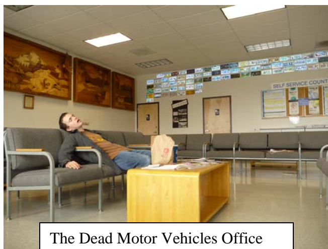
The Dead Motor Vehicles Office

- Spell check really doesn't catch everything! A common piece of equipment in the fleet is a "Winch", but we may or may not have gotten an application from a "Skilled Wench Operator" (which should not be construed to give the impression that the applicant didn't get a (very) good rating ☺)